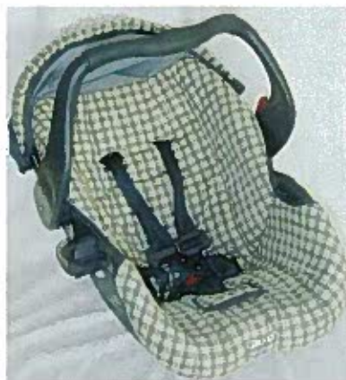
Example of an Aft-Facing CRS with Internal Harness

13. TYPES OF CRSs THAT MAY BE APPROVED BY THE FAA THROUGH A TC, STC, TSO, OR UNDER SECTION 21.305(d). Typically, a CRS approved by the FAA through the TSO process will be similar in design to a CRS meeting FMVSS No. 213 requirements. However, CRS approved by the FAA through a TC, STC, or under § 21.305(d), may contain novel and unusual design features. In addition, the regulations allow the use of booster-type or vest- and harness-type CRSs, if the FAA has approved them through a TC, STC, TSO, or under § 21.305(d) (§§ 121.311(b)(2)(ii)(C)(3), 121.311(b)(2)(ii)(C)(4), and 121.311(c)(1); http://www.gpoaccess.gov/ecfr ). The aircraft operator is responsible for ensuring that crewmembers have proper training and information regarding the use of CRSs approved for use on aircraft through a TC, STC, TSO, or under § 21.305(d). The following is an example of a CRS that has been approved by the FAA through STC, as well as under § 21.305(d):