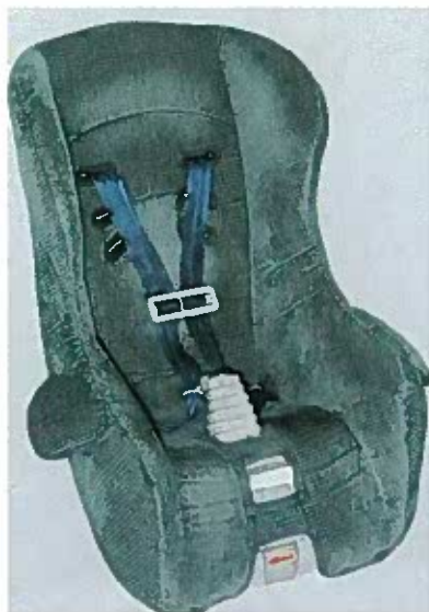
Example of a Forward-Facing CRS with Internal Harness