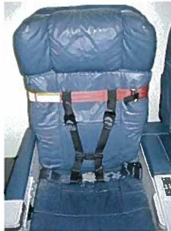
Example of a CRS approved through STC and under § 21.305(d)

14. CRSs NOT APPROVED FOR USE DURING GROUND MOVEMENT, TAKEOFF, AND LANDING. In 1994, the FAA issued a study entitled “The Performance of Child Restraint Devices in Transport Airplane Seats.” The research for the study conducted by the FAA Civil Aerospace Medical Institute (CAMI) involved dynamic impact tests with a variety of CRSs installed in transport category aircraft passenger seats. The results of this study were used as the basis for prohibiting the use of the following devices during ground movement, takeoff and landing. Dynamic video of the FAA Office of Aerospace Medicine Report, “The Performance of Child Restraint Devices in Transport Airplane Passenger Seats,” may be viewed at: