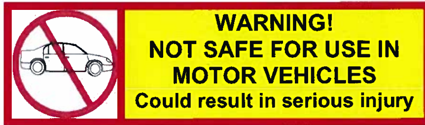
FIGURE 1. REQUIRED WARNING LABEL FOR AVIATION CHILD SAFETY DEVICES WITHOUT FMVSS NO. 213 APPROVAL

c. Consumer Education. The FAA is taking steps to educate consumers regarding the difference between devices that are safe for use in both motor vehicles and aircraft vs. those that are safe only for use in aircraft. The FAA revised the information on its Web site for passengers traveling with children ( http://www.faa.gov/passengers/fly_children/crs/ ) and put additional educational material on the site to remind people that ACSDs are not safe for use in motor vehicles. The FAA also encourages airline personnel, especially flight attendants, to take advantage of opportunities to educate parents and guardians who use ACSDs on aircraft regarding the differences between those “aviation only” ACSDs and devices that can be used safely in both aircraft and motor vehicles.